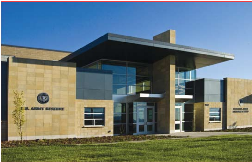
Armed Forces Reserve Center