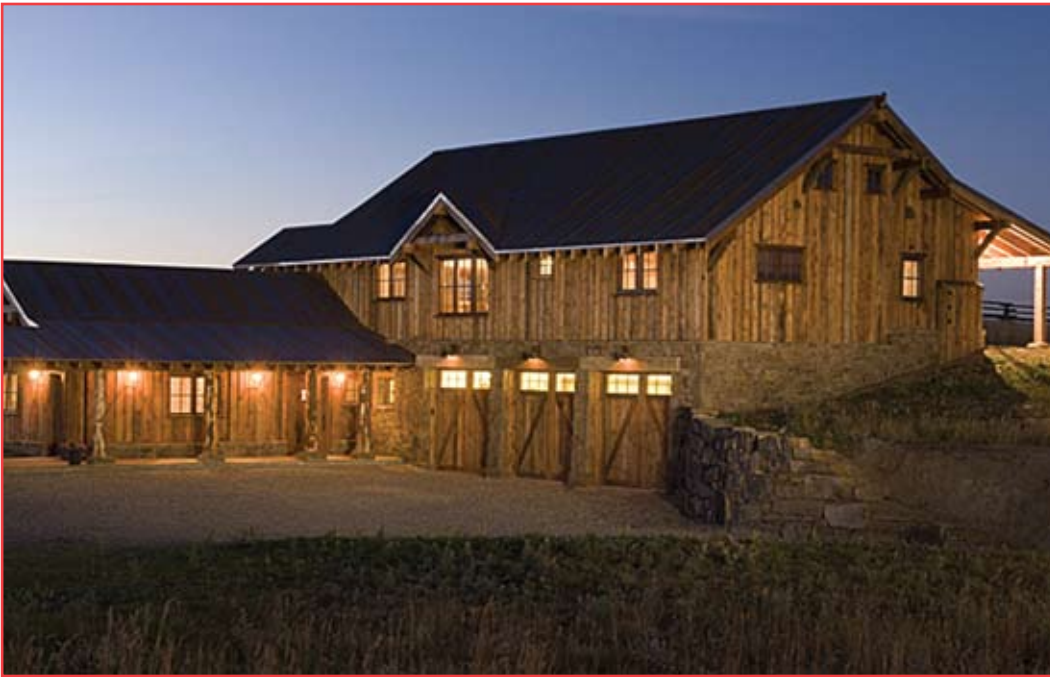
Von Arentschildt Residence